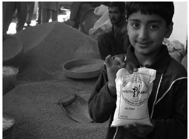
Different stages in the production process in a chakki mill in Afghanistan: from adding a vitamin and mineral premix to whole wheat grains to the end product, a packet of fortified flour.

significant impact that fortification has on reducing micronutrient deficiencies.